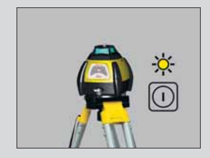
Out of Level Indication

The H.I. or Elevation Alert function monitors the leveling of the Leica Rugby 50. Any significant disturbance or movement of the tripod will cause the alert function to activate. The Leica Rugby 50 will stop operation and will sound an alarm to prevent possible errors.