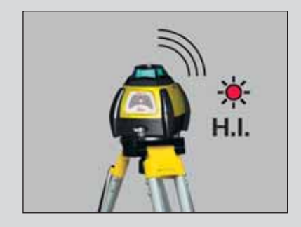
H.I. (Elevation) Alert

The Leica Rugby 50 is designed to always turn on in automatic self-leveling mode. No concerns for setting up the laser incorrectly. Set up the Leica Rugby 50 within its wide leveling range, the instrument will automatically self-level and work can begin.