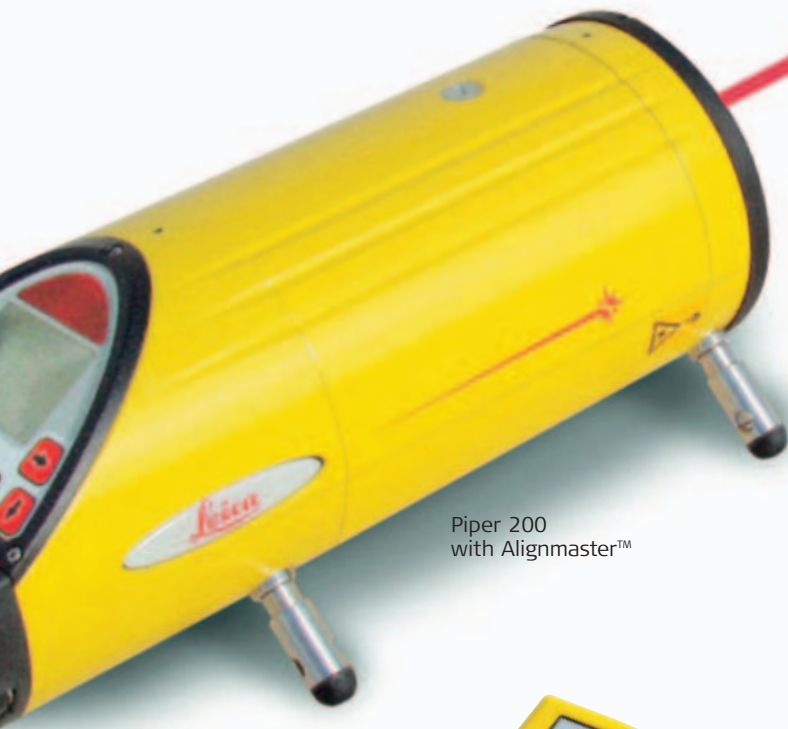
Piper 200 with Alignmaster™