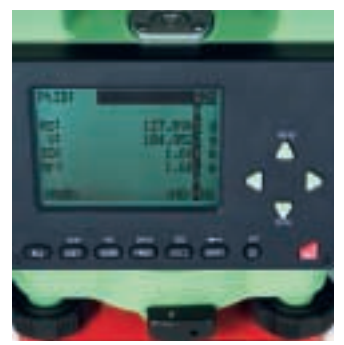
Only shorthand is faster

Leica Geosystems' legendary quality standards: If it's signed Leica Geosystems, Leica Geosystems stands behind it. Moreover, each and every TPS300 is subjected to a series of stringent tests before it is shipped, so all instruments easily fulfill the applicable requirements for field use, including compliance with IP54 protection according to IEC 529.