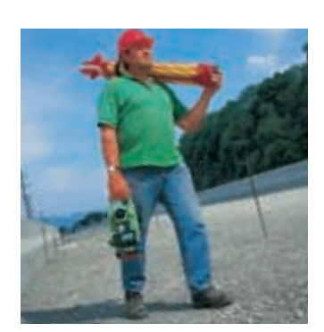
The lightest total station