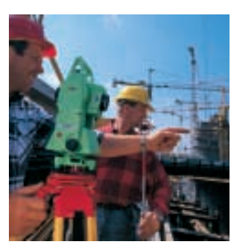
300 meters in 0.3 seconds