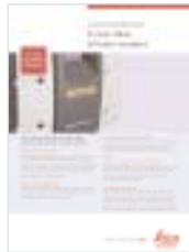
Leica ScanStation Product information and specifications