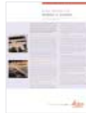
Leica Cyclone 5.6 MODEL, SURVEY Product information