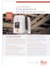
Leica HDS6000 Product information and specifications

Laser class 3R in accordance with IEC 60825-1 resp. EN 60825-1