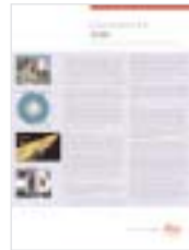
Leica Cyclone 5.6 SCAN Product information