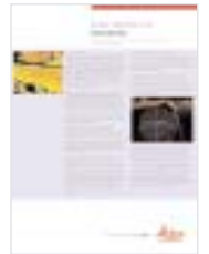
Leica Cyclone 5.6 REGISTER Product information

Business Unit Scanning: Leica Geosystems HDS LLC 4550 Norris Canyon Road San Ramon, USA, CA 94583 +1 925 790-2300